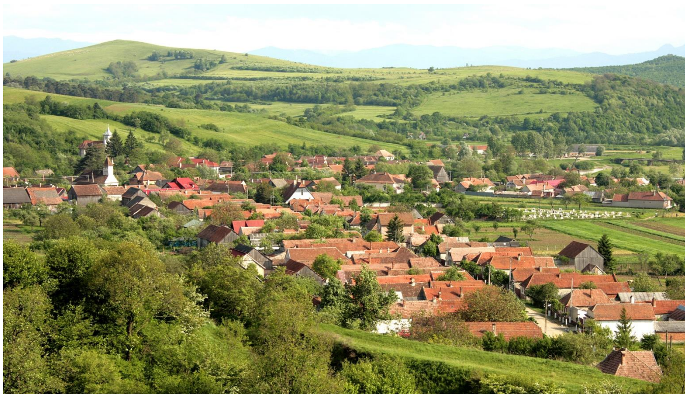
Figure 1: Romanian Rural Area

A strategy on bioeconomy has not yet been released, but there are various policy initiatives towards bioeconomy: the National Strategy for Research, Innovation and Smart Specialization 2022-2027, the Strategy for the development of the agri-food sector 2020–2030, the Romanian Strategy for Competitiveness 2021-2027 and the Integrated National Energy and Climate Plan. Additionally, seven development regions (NUTS 2) have published strategies related to bioeconomy.